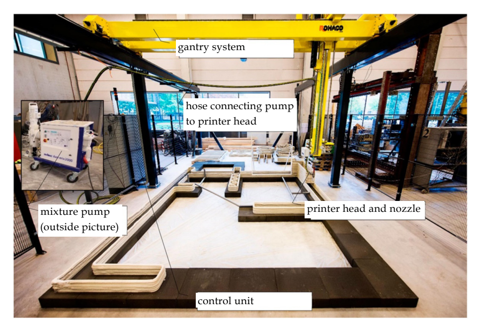
Figure 2b: Gantry-based concrete printer, source: Bos et al. [2016]

Figure 2a: Robotic-based concrete printer, source: Gosselin et al. [2016]