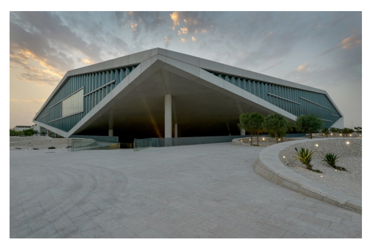
Figure 8. Façade National Library, Doha, Qatar

In 2019 another building with these corrugated glass walls of the architect OMA will be finished: the Taipei Performing Arts Centre in Taiwan. A large theatre complex with a central cube like building of 60 x 60 x 60 meter cladded with the corrugated glass panels as we know from Porto and Doha.