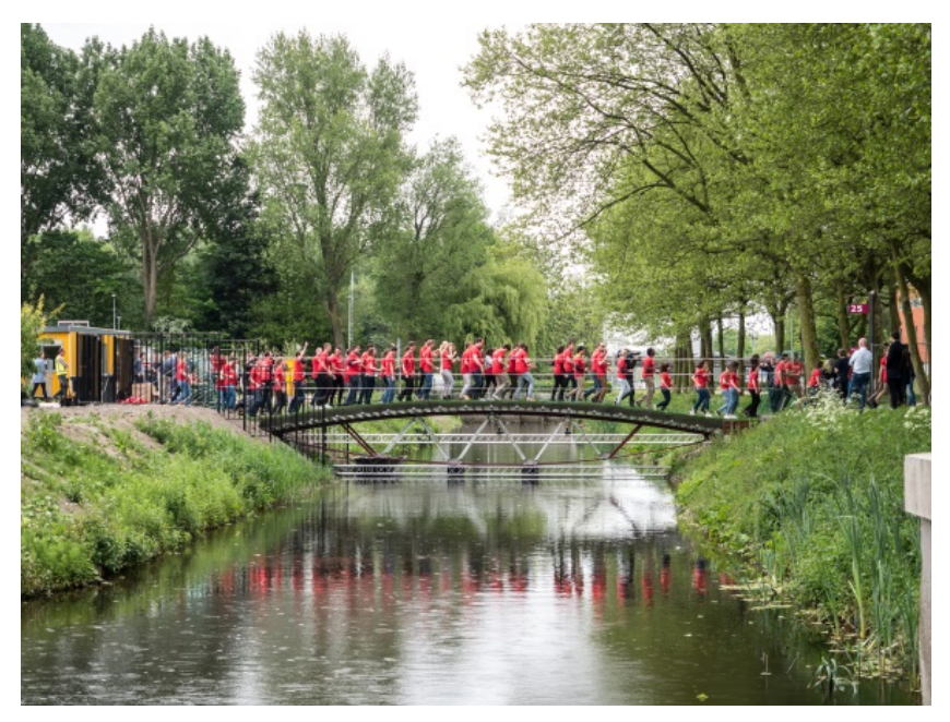
Figure 4. Test loading the Glass Truss Bridge

1.4 Glass Swing for the 2018 Glastec, architect/ engineer Delft University of Technology Continuing on the strategy of making glass bundle columns with a central steel bar as applied in the Glass Truss Bridge we i.e. Delft University, wanted to make a special object to exhibit a special structure for the 2018 Glastec. We decide to make a swing, since this is not only a fun structure but also subjected to a very special dynamic load case. To make the optimal structure we decide to make a parametric design with the computer programs Rhino and Karamba. An initial shape was slowly transformed into the optimal patron of glass bundle columns. For the essential structural nodes, we chose for 3D printed ones made out of steel or PETG. This special structure was submitted to very serious tests by students before it was sent off to the Glastec. Also we connected to the swing devices to measure stresses and deformations while using the swing.