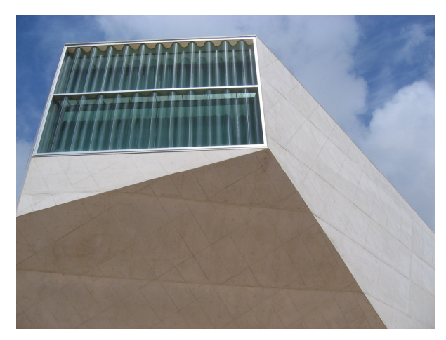
Figure 6. Façade Casa da Musica, Porto, Portugal

2.3 Façade Museum MAS, Antwerp (B), realized in 2008, architect Neutelings Riedijk The city of Antwerp, Belgium had a number of small museums housed in circumstances not fit for museum objects. It was decided to concentrate all these museums in a little island in the old harbour of Antwerp (fig. 7). An international competition was held and the architectural firm Neutelings Riedijk won. Their design was a stack of concrete rectangular boxes, each rotated 90 degrees to its neighbour. In this way the public could walk up slowly in a big spiral staircase, visiting each box i.e. museum, one by one. To protect people from rain, cold and wind the architects decided to use the same corrugated