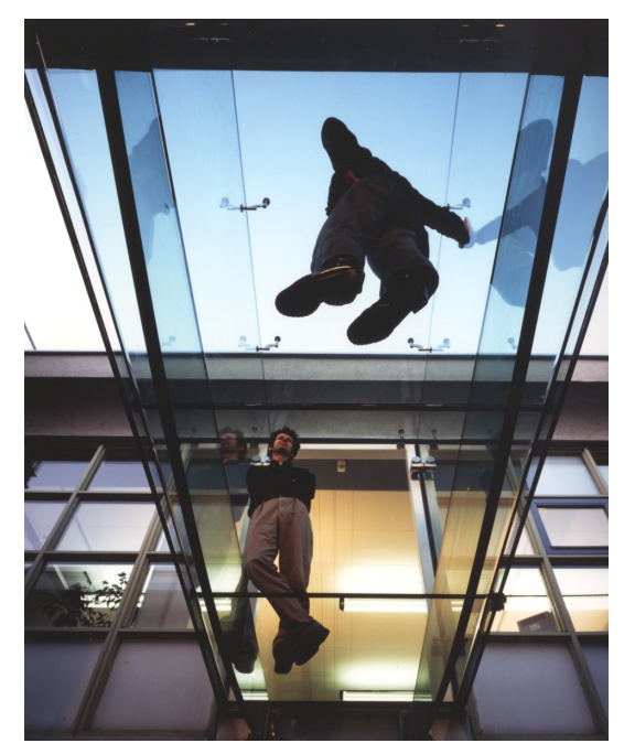
Figure 1. Bridge Rotterdam, the Netherlands

there. Each icicle was formed by 3 triangularly shaped glass panels. Four sets of big beams ware laid out at a centre to centre distance of 1 meter. Perpendicular to the big beams 3000 small beams were placed. The bridge was tendered out and proved to be ten times as expensive as a standard steel bridge. A political decision was quickly made and this beautiful design disappeared in the future as un-build. Not everything was lost; for the