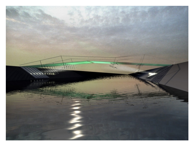
Figure 2. Bridge design for the Floriade in Hoofddorp, the Netherlands

there. Each icicle was formed by 3 triangularly shaped glass panels. Four sets of big beams ware laid out at a centre to centre distance of 1 meter. Perpendicular to the big beams 3000 small beams were placed. The bridge was tendered out and proved to be ten times as expensive as a standard steel bridge. A political decision was quickly made and this beautiful design disappeared in the future as un-build. Not everything was lost; for the