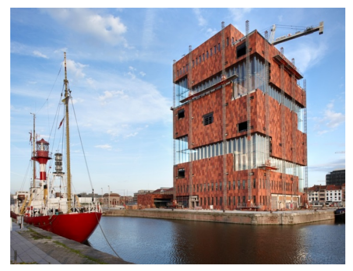
Figure 7. Façade of museum MAS, Antwerp, Belgium

2.3 Façade Museum MAS, Antwerp (B), realized in 2008, architect Neutelings Riedijk The city of Antwerp, Belgium had a number of small museums housed in circumstances not fit for museum objects. It was decided to concentrate all these museums in a little island in the old harbour of Antwerp (fig. 7). An international competition was held and the architectural firm Neutelings Riedijk won. Their design was a stack of concrete rectangular boxes, each rotated 90 degrees to its neighbour. In this way the public could walk up slowly in a big spiral staircase, visiting each box i.e. museum, one by one. To protect people from rain, cold and wind the architects decided to use the same corrugated