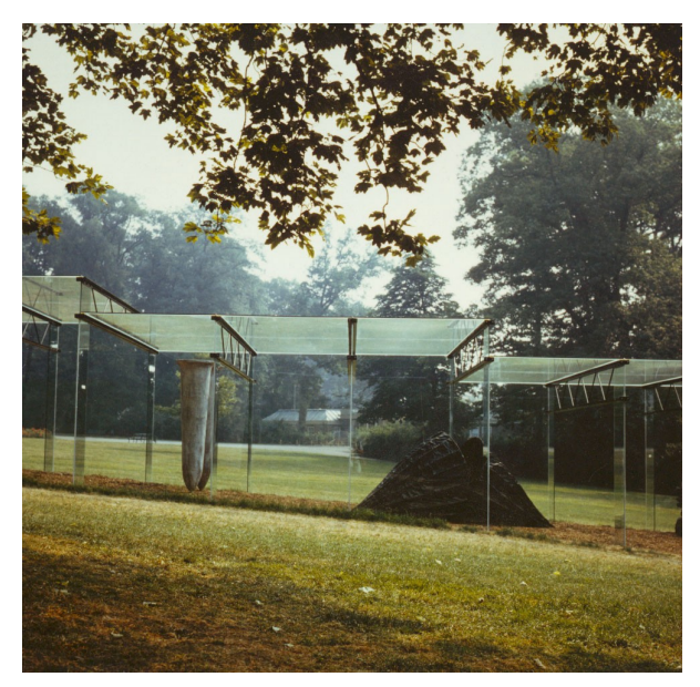
Figure 5. Sonsbeek Pavilion, the Netherlands

The architects and engineers worked out the structural design for this temporary structure (March to October 1986). It was composed of glass portal frames, centre to centre 2.5 meter, made from two vertical glass fins and a horizontal, very light, steel truss. The fins gave support against the wind forces, the steel truss supported the glass panels that formed the roof. The transversal stability was given by the portal frame action of the two glass fins and the steel truss, the lateral stability was provided by the Vierendeel (shear force) action between the glass panels in the facades, the connecting silicone joint provided the structural connection between the glass panels.