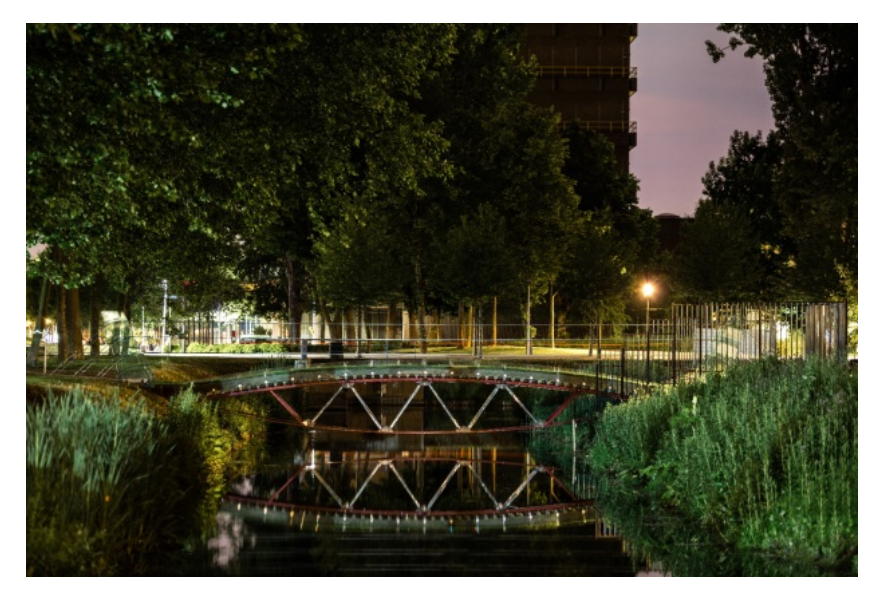
Figure 3. The Glass Truss Bridge at Delft University campus, the Netherlands

In 2016 a competition was held for technicians of the Delft University to design a bridge over a 14-meter-wide canal for the Green Village (fig. 3, 4). The Green Village is an area of the campus of the Delft University where studies in sustainable techniques are employed. Consequently, this bridge had to be as sustainable as possible. The design team led by the author decided to propose an arch bridge made from massive cast glass blocks. This concept will be explained in the chapter 3 (p. 10). An arch only starts to work properly when the last stone is put in his place. So a supporting structure was necessary to make the Glass Arch Bridge. This was the Glass Truss Bridge; a lenticular shaped Warren truss with glass diagonals. The glass diagonals are formed by a bundle of six massive glass bars of 20 mm diameter with a steel bar of 12 mm in the middle. The Glass Truss Bridge was built in the Stevin II lab close by the building site by technicians of the Delft University. To take all doubts away regarding the structural safety of this experimental bridge a group of 60 students from the Delft University marched over the bridge, proofing that the Glass Truss Bridge is very strong and capable of carrying large loads.