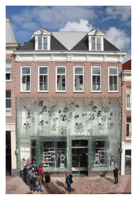
Figure 9. Shopfront in the PC Hooftstraat, Amsterdam, the Netherlands

frames, doors etc., made out of glass (fig. 9). The client found this an intriguing, beautiful proposal and commissioned Delft University to investigate all critical technological issues like strength, stiffness, water tightness, insulation value, temperature/ sun radiation induced movement etc. After this research the choice was made for cast glass massive bricks and window frames. The bricks are glued together by an adhesive that hardens in a few minutes under ultra violet light. An extra small layer of silicone in each joint is used to safeguard the water tightness. Since this is the first time that on this scale, in outside conditions, a façade composed of glass bricks is built, the quality control, both in the factory and on the building site, was done by Delft University.