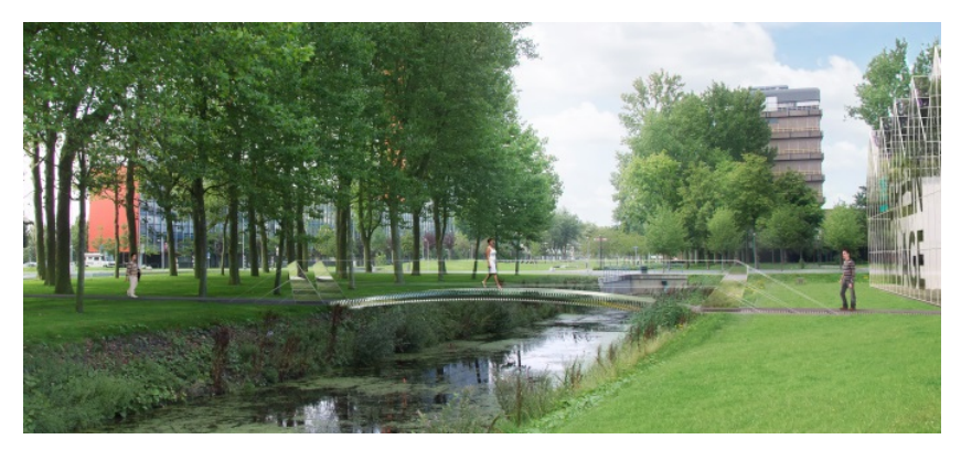
Figure 10. Artist impression of the Glass Arch Bridge

Therefore, a rather thick layer of glass stones must be installed to produce such a big compression that tensile stresses caused by big local point loads are always eliminated. We entered a competition for a "sustainable" bridge for the Green Village of Delft University of Technology which we won (see section 1.3). We are now (spring 2018) running all kinds of research to prove the technical issues regarding an all glass arch with a thin layer of plastic in each joint, no adhesive, to make it demountable and reusable.